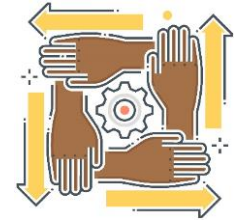
Joint Statement Initiatives