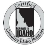
US Reg. No. 4221402

Similarly, Canada has registered 'Idaho' and Idaho labels as certification marks (CA Reg. No. TMA706317 and CA Reg. No. TMA728878).