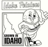
US Reg. No. 2914309