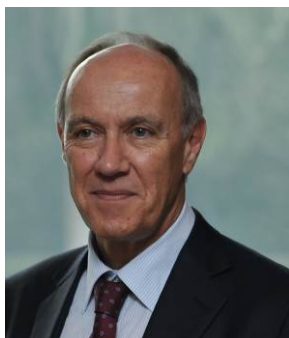
Mr Francis Gurry