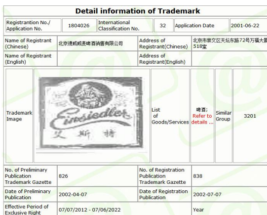
Figure 4.2: The combination trademark '艾斯特 Einsiedler' registered by Dewei

In 2008, the Longyan Wanda Trade Company imported products from the Einsiedler Brewery through a German distributor, the packaging of