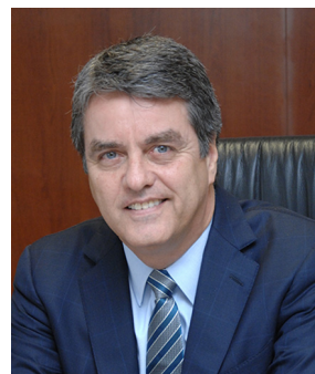
Mr Roberto Azevêdo

This volume is the fifth in a series of annual publications from the World Intellectual Property Organization (WIPO) and the World Trade Organization (WTO). Prepared by the WIPO-WTO Colloquium for Teachers of Intellectual Property, this collection of academic papers represents an important contribution to international scholarship in the field of intellectual property (IP). Today we witness ever increasing, more diverse forms of international interaction on IP, yet equally we see growing attention to differing national policy needs and social and developmental priorities in this field. The Colloquium Papers series highlights the importance of fostering scholarship in emerging IP jurisdictions, harvesting the insights from policy and academic debates from across the globe, and promoting mutual learning through the sharing of research and scholarship on a broader geographical base.