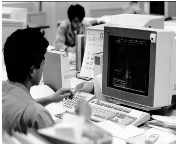
A Singapore agreement to eliminate tariffs on computer products would unlock a key tool of future growth.

of future growth in industrial and developing countries alike.