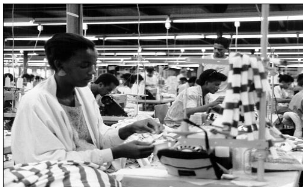
Developing countries are urging more commercially meaningful implementation of the WTO Textiles Agreement.

The United States maintained that its integration programme was in full compliance with the ATC, which left the choice of products to be integrated to the importing