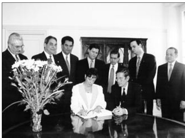
Trade Minister Nitzia R. de Villarreal signs Panama's Protocol of Accession to the WTO on 2 October, witnessed by Panamanian and WTO officials.