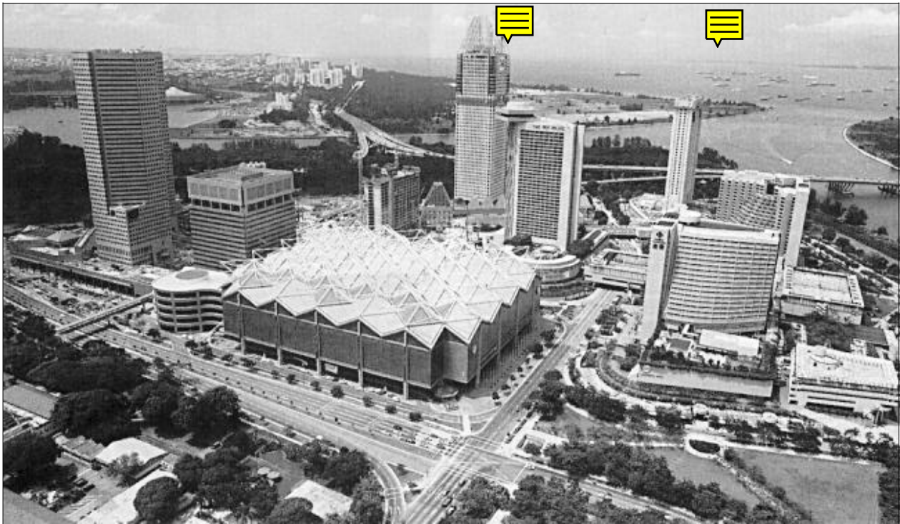
WTO's first Ministerial Conference will be held at Singapore's modern Suntec Centre.