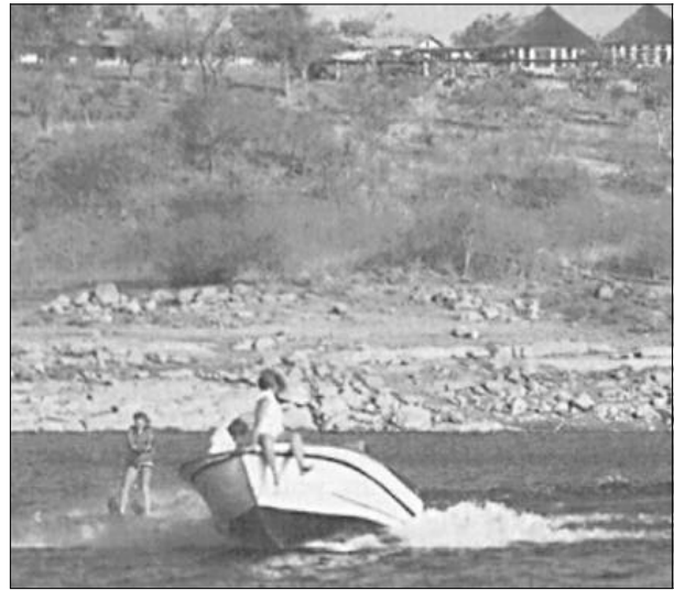
Boatsurfing at Kafue National Park: tourism is a major growth industry.

Specific questions were also raised on the compatibility of the Import Declaration Fee with WTO rules and timetable for its abolition; as well as the incorporation of WTO disciplines into domestic trade legislation including on cus-