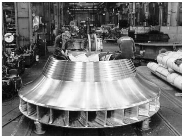
Norway's rich hydroelectric power resource is considered to be a major comparative advantage.

The representative said that technical regulations and SPS measures were consistent with WTO obligations. He provided further details on assistance to developing countries