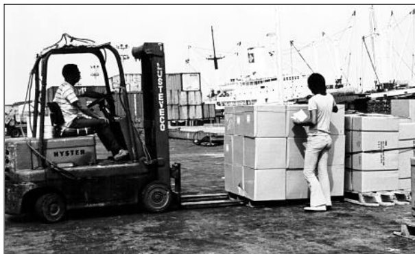
The United States and the EC are calling for further market opening in the developing countries and stricter enforcement of anti-circumvention rules.

be improved through greater transparency and ensuring impartiality in decision-making; and