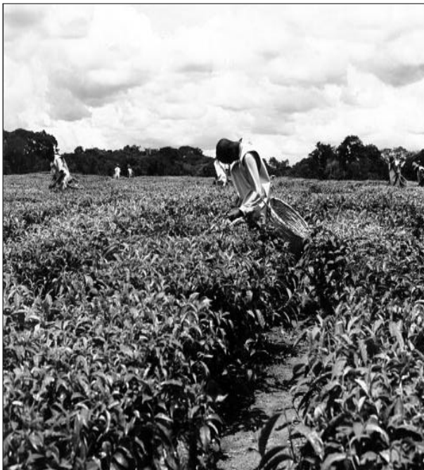
We need a message of unity and determination among industrial and developing countries to help the least-developed countries.