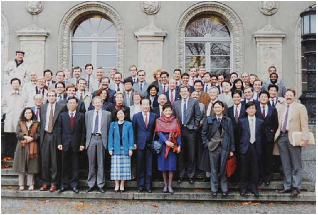
TRIPS negotiators in 1990 at the Centre William Rappard (authors in the volume shown below).