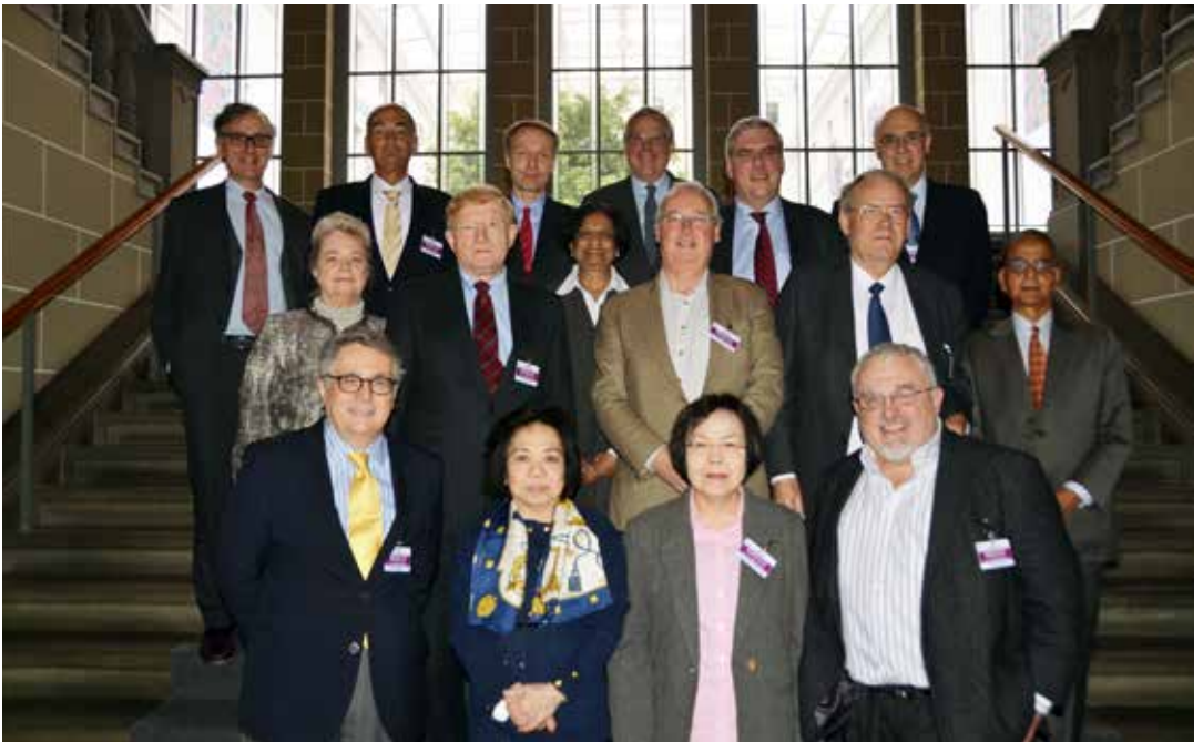
Many of the contributors to this book, attending the Symposium on the TRIPS Agreement in February 2015.