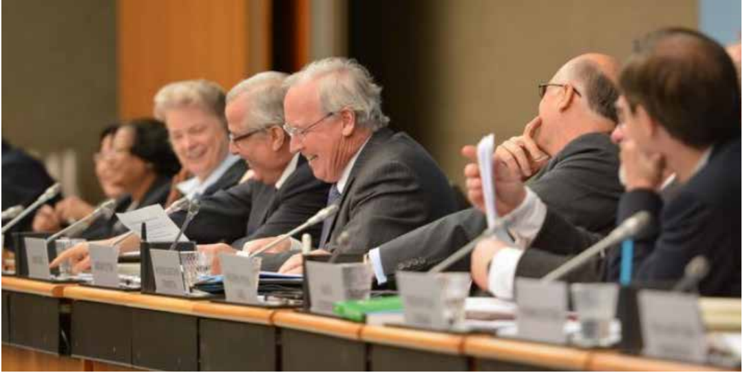
Symposium on the TRIPS Agreement, 26 February 2015, at the WTO headquarters in Geneva, Switzerland.